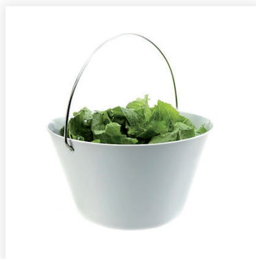
Eva Solo Bowl with Handle sku E567808, E567810, E567820

Contact us for the wide variety of Eva Solo accessories available.